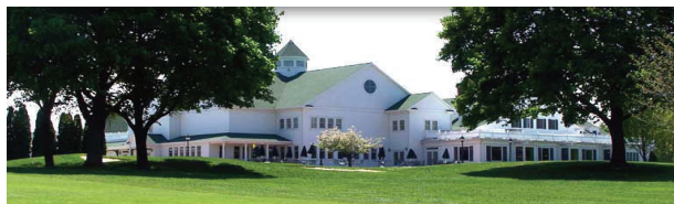
The Country Club of Lansing is located at 2200 Moores River Drive. Moores River Drive is located east of S Waverly Road and South of 496

Please help us make this year’s Banquet and Silent Auction a success. Like all non profits, Chosen Vision has been significantly impacted by our weakening economy. We have seen a reduction of nearly 25% in both donators and donations and this has taken a toll on our operating budget. This is our only major fundraiser—your support to this year’s event is more important than ever.